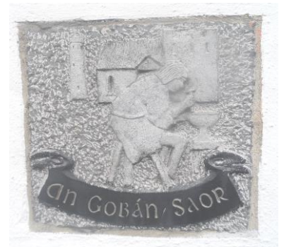
Stone carving of the Gobán Saor

He traveled extensively in Ireland, England and even the continent constructing buildings. He would remain in an area for a lengthy time living in a tent like structure. Masons had their own private signs. Goban Saor's symbol of a cat with two tails which can be viewed at the Swiss Cottage at Cahir, County Tipperary.